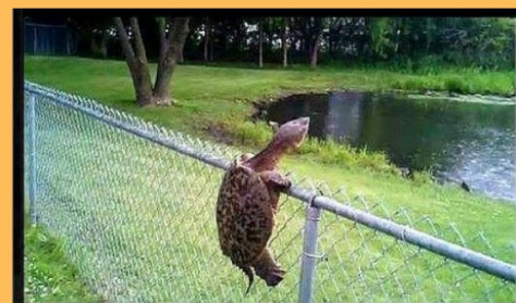
HAVING A HARD TIME GOING TO CHURCH? Don't let your obstacles become your excuse. Let them become your testimony! www.360day.org

"Let me forget the world and be swallowed up in the desire to glorify God." -David Brainerd